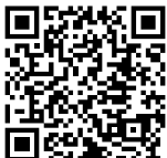
Download latest version

DuPont Packaging Graphics continues to be a global technology leader in the development and supply of flexographic printing systems. Our R&D team continues to develop innovative new solutions to help our customers expand their business by taking advantage of new and profitable opportunities in the growing flexographic packaging market. The DuPont Packaging Graphics portfolio of products includes DuPont™ Cyrel® brand photopolymer plates ( analog and digital ), Cyrel® platemaking equipment, Cyrel® round sleeves , Cyrel® plate mounting systems and the revolutionary Cyrel® FAST thermal system .