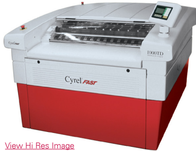
View Hi Res Image