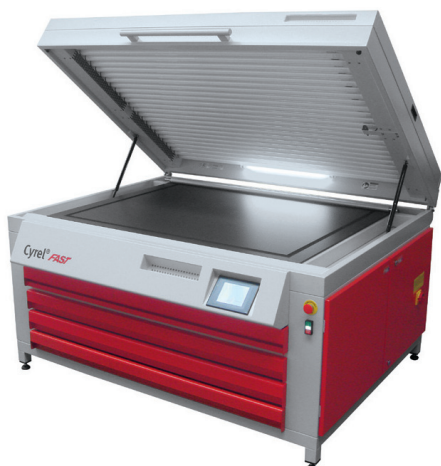
DuPont™ Cyrel® 1000 ECLF

State-of-the-Art Exposure, Light Finisher and Post-Exposure Unit