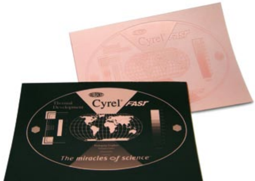
DuPont™ Cyrel® DFH